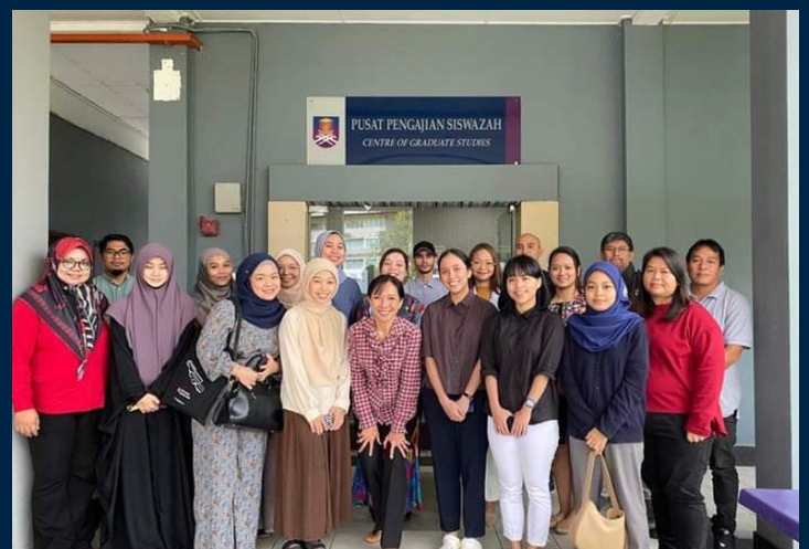
Sesi bergambar bersama pelajar