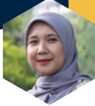
Mar Unit Akademik, IPSis

Memasang Pelita di Malam Hari, Syawal tiba dipagi hari, Sepuluh jari tersusun rapi, memohon maaf seikhlas hati. Selamat Hari Raya Aidilfitri Maaf Zahir Batin.